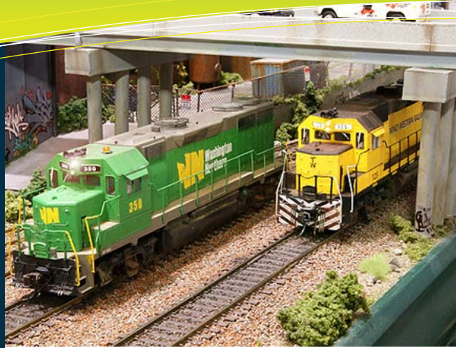
WN GP38-2 #350 and Tenino Western GP40 #125 are seen in Union Yard. Both are new additions to the motive power fleet.

The layout operated near flawlessly I'm happy to report, and I got to meet many fine folks and new modeling friends in the area. The only bad thing about being on the tour, was I had to miss seeing the other eight layouts and the progress made on them.